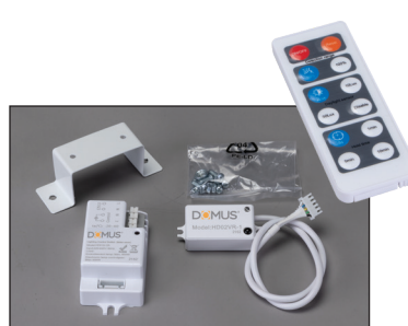
Internal ON/Off Sensor